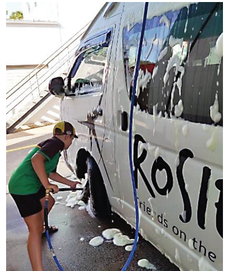
Pictured: Padua students keep the Rosies van sparkling