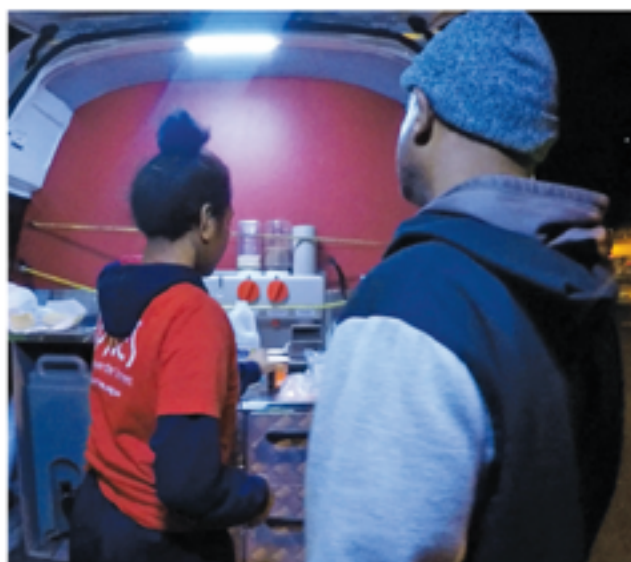
Young volunteers sharing friendship

Young adults are increasingly being drawn to activities that serve the marginalised. We see this with many of our ex-students coming back wanting to serve as adult volunteers. Their strong social justice bent is formed through the values and spiritual connections developed at school and church. Our experience on the street also tells us we are seeing an increase in the number of young patrons on the street who are seeking friendship and belonging. We will soon commence a trial of parish-based outreaches to bring these two groups together – young volunteers sharing friendship with young marginalised persons.