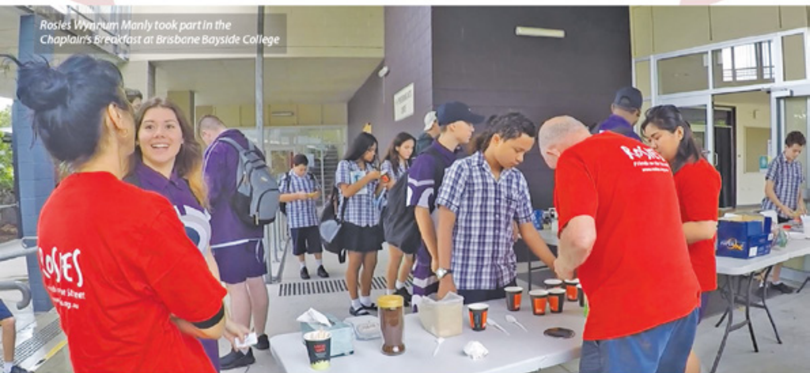
Rosies Wynnum Manly took part in the Chaplain's Breakfast at Brisbane Bayside College

Rosies has been partnering with Brisbane Bayside State College to support students who are working towards their Certificate I in Active Volunteering. Students are attending street outreaches with Rosies and also hold a pop-up outreach at the Chaplain's weekly breakfast.