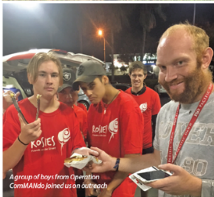
A group of boys from Operation ComMANdo joined us on outreach