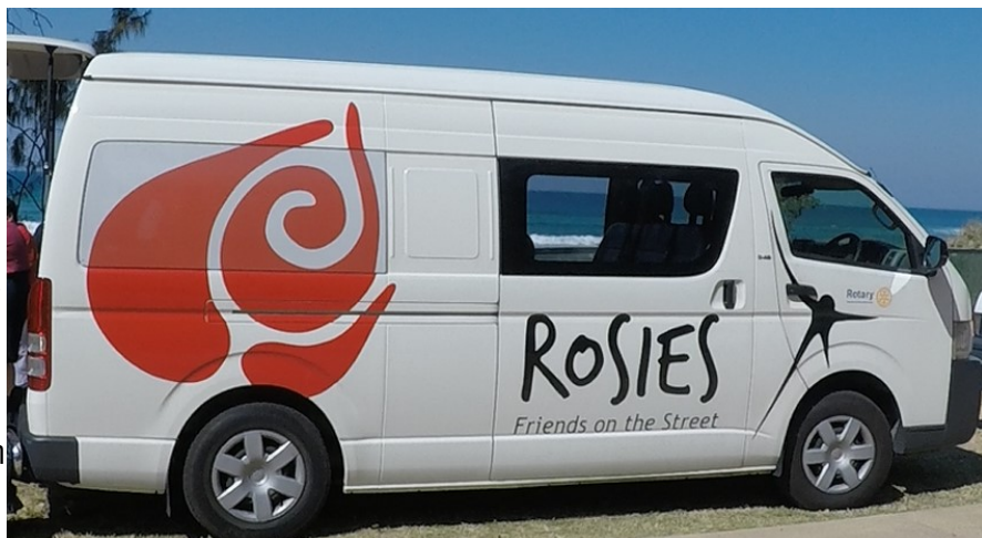
Our vans are professionally fitted to ensure maximum functionality and safety.

We are so grateful to all our supporters enabling us to share friendship and create belonging in a safe, consistent and presentable manner.